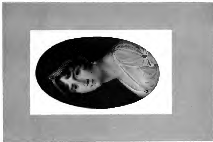
THE EMPRESS JOSEPHINE BY JEAN BAPTISTE ISABEY